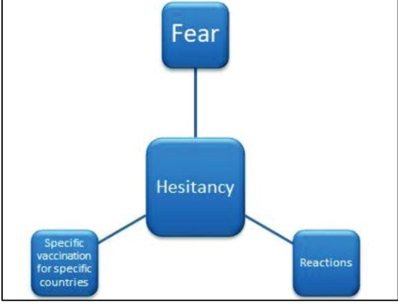
Figure 5: Hesitancy

"Vaccination is not to protect myself from this deadly disease but it is to keep the community safe from corona. The chances of infection reduced with vaccination and we can keep our family, kids, neighbors and people with whom we are working safe" (Participant 15, Age 40). "I think corona vaccination is very important for everyone. Everything is disturbed due to corona and vaccination is the only way to come out from this miserable situation" (Participant 15, Age 43). "The benefits of corona vaccination are not limited to me. I am a nurse and if I am not vaccinated, how can I prevent my family members and other people safe from corona. If I am vaccinated, it's mean that I am giving benefit to myself as well as to my family and other people" (Participant 13, Age 37). The fourth theme is hesitancy. There were three codes for hesitancy as Fear, Reactions, and Specific vaccination for specific countries (Figure 5).