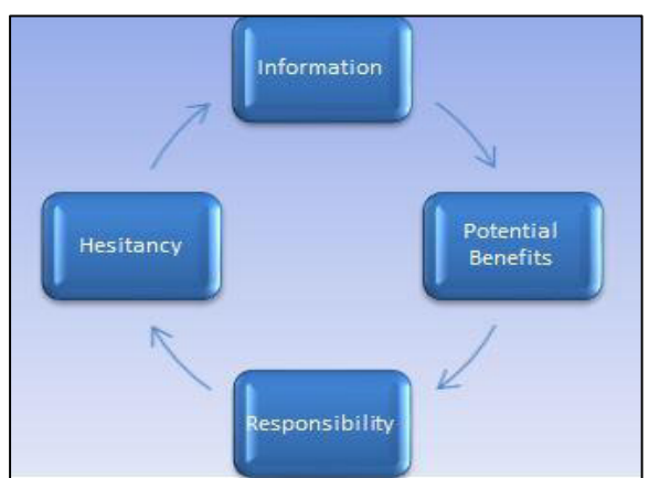
Figure 1: Thematic Analysis of the Data

Overall, 117 codes were identified after the initial analysis. Axial coding was done after omitting the unnecessary codes. A total of 15 codes were identified after omitting the unnecessary codes. These 15 codes were arranged into 4 themes. These themes were "Information", "Potential Benefits", "Responsibility", and "Hesitancy" (Figure 1).