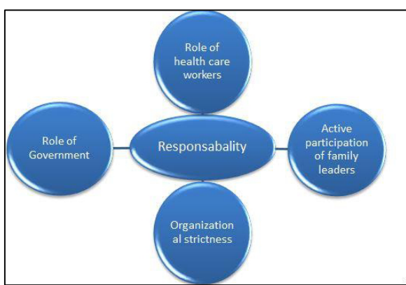
Figure 3: Responsibility

"I exactly don't know properly about the covid-19 vaccination. It is totally a new thing in the health care system. I don't know whether these vaccinations may have a positive or negative impact on individuals. We follow the government rules and policies" (Participant 3, Age 37). "Different vaccination is available in government health care setups. Private health care setups also take part in the vaccination of people. I remember a few names of covid-19 vaccinations such as sinopharm and sinovac, the other I don't remember" (Participant 11, Age 32). "There are different types of vaccines. Some of them have one shot or some of them have two. It's the job of vaccinators to remember the shots and frequency. I don't exactly know regarding the duration gap between the doses" (Participant 6, Age 34). The second theme was responsibility. This there was generated from four codes such as "Role of health care workers", "Responsibility of the government", " Active participation of the head of the family", and "organizational strictness" (Figure 3).